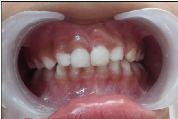
Fig 7. Occlusion after the removal of splint.

Three weeks after the injury, after clinical and radiographic examination of periodontal and bone healing, the splint was removed. The soft tissues had healed, and a good occlusion was established. (Figure 7)