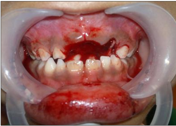
Fig. 1 Clinical view showing maxillary incisors in cross-bite, shortly after injury.

College, Sundernagar, about 2 hours after fall from the bicycle resulting in dental trauma. (Figure 1) His medical history was uneventful with no known allergies. He did not lose consciousness nor did he vomit following the injury. Extra-oral examination revealed no disturbances in the temporo-mandibular joint. Swelling of the lower lip was observed. Intra-oral examination revealed hematoma of the lower lip, soft tissue lacerations, and palatal displacement of both maxillary primary central incisors into cross bite relations with the opposing mandibular teeth. Despite this, the child could close his molars into normal occlusion. A periapical radiograph of the premaxilla presented shortened images of both central incisors with a wide periapical radiolucent area indicating that the apices of the primary teeth were pushed labially, away from the developing permanent successors. (Figure 2)