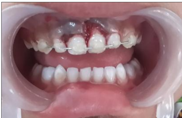
Fig 6. Repositioned and splinted teeth.

The treatment protocol consisted of careful repositioning of the teeth under local anaesthesia, and as the repositioned teeth often have a tendency to migrate from their position, a flexible splint was applied for 2-3 weeks. (Figure 6) Patient was instructed to maintain good oral hygiene and was given a course of antibiotics and analgesics.