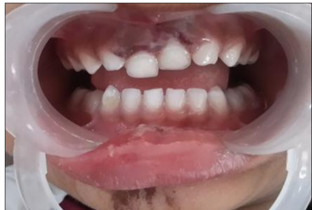
Fig 5. Clinical view shortly after trauma

A five year old girl reported to the Department of Pedodontics and Preventive Dentistry of Himachal Dental College, Sundernagar, H.P. with a history of fall while playing 5-6 hours back. (Figure 5) On clinical