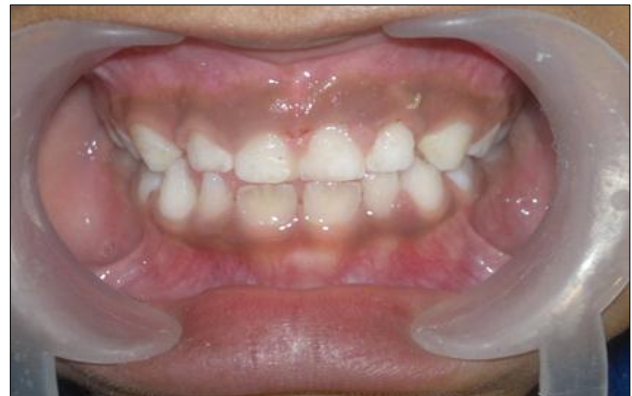
Fig.4 Clinical view after the removal of splint.

removed. The teeth were present in a good occlusal relationship. (Figure 4) On the following recall examinations, teeth presented physiologic mobility, with no sensitivity to percussion. Surrounding soft tissues were intact and the patient did not report any pain or discomfort.