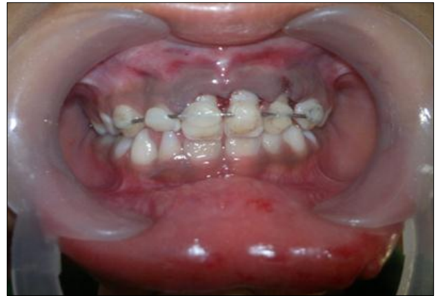
Fig.3 Clinical view showing the repositioned teeth with light curing resin and orthodontic wire

Patient was kept on weekly recall. After three weeks, when the mobility was markedly reduced, the splint was